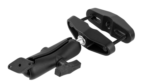
RAM-102U-247 RAM<sup>®</sup> Universal Post Clamp Mount with Diamond Plate C-Size with Standard Arm