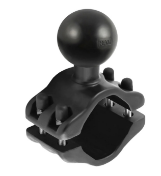
RAM-271U-2 RAM<sup>®</sup> Rail Clamp Ball Base for 2" - 2.5" Rails C Size