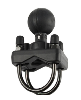
RAM-235-1U RAM<sup>®</sup> Double U-Bolt Ball Base for 1.25" - 1.5" Rails C Size