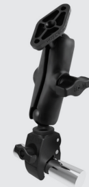
RAM® Tough-Claw™ Small Clamp Mount RAP-B-400-238U