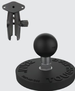
RAM® Tough-Mag™ 66mm Dia. Mount RAM-B-MAG66U RAM-B-103-238U