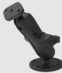
RAM® Double Ball Drill-Down Mount RAM-B-138U