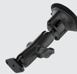
RAM® Twist-Lock™ Suction Cup Mount RAM-B-166U