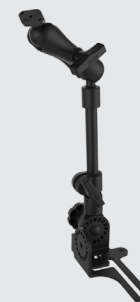
RAM® Pod HD™ Mount w/ 12" Aluminum Rod RAM-316-HD-238U