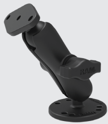
RAM® Double Ball Drill-Down Mount RAM-B-138U