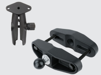
RAM® Square Post Mount 1.75"-4" Wide RAM-B-247U RAM-B-103-238U