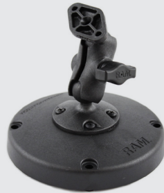
RAM® Platform Double Ball Mount RAP-B-291-A-238U